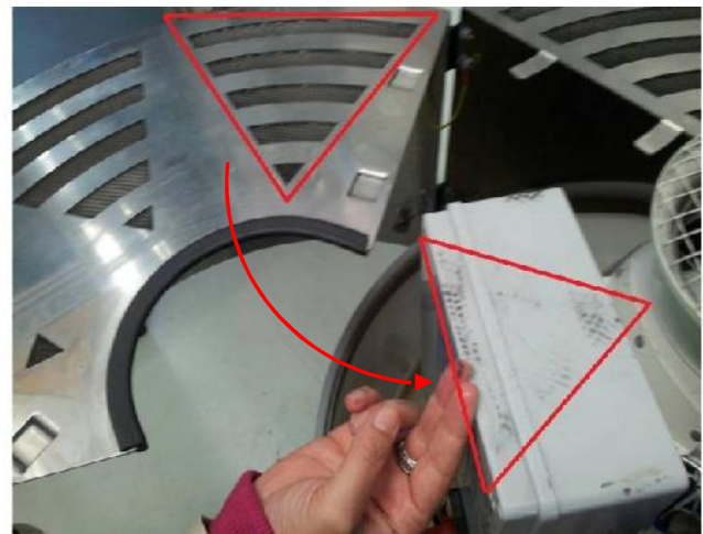
Fig.2 - Iron dust deposit at the top of the machinery, replicating the triangular shape of the protection grid